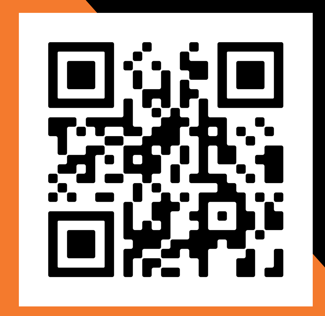
Create a Custom Calendar for Free