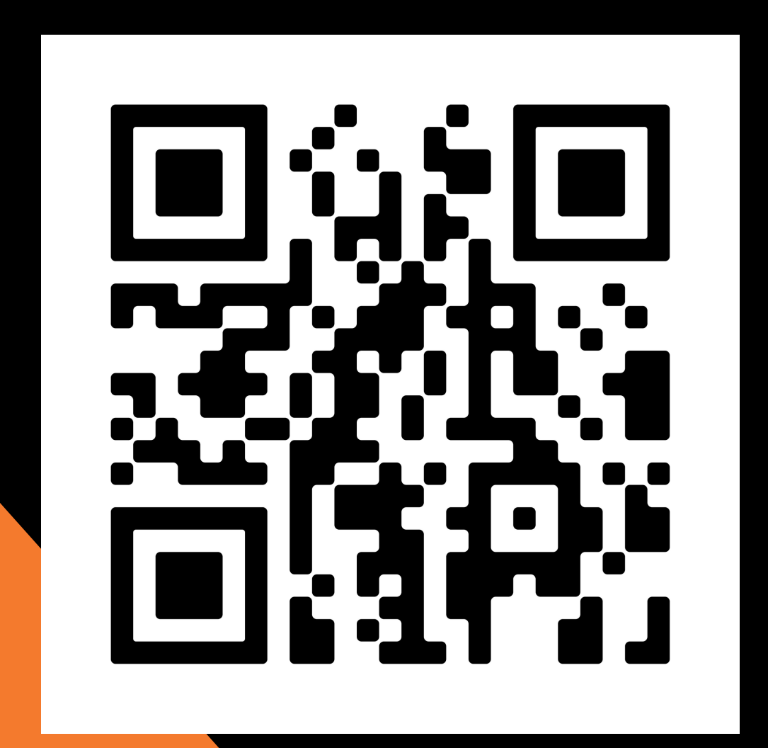
Student Health and Psychological Services

Online Learning at times may be challenging, from one RCC Tiger to another, we are here to support you! Start Strong, Finish Strong!