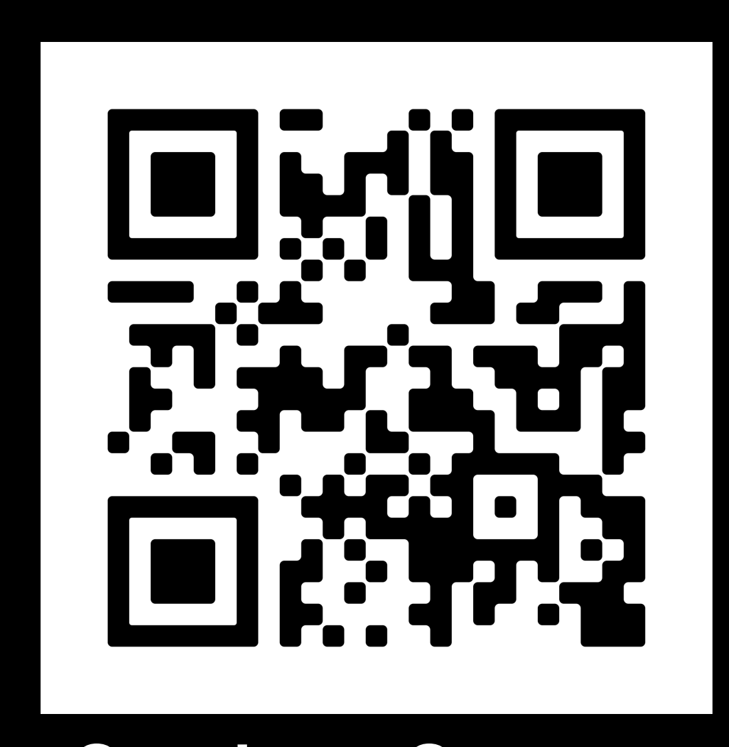
Student Support Programs