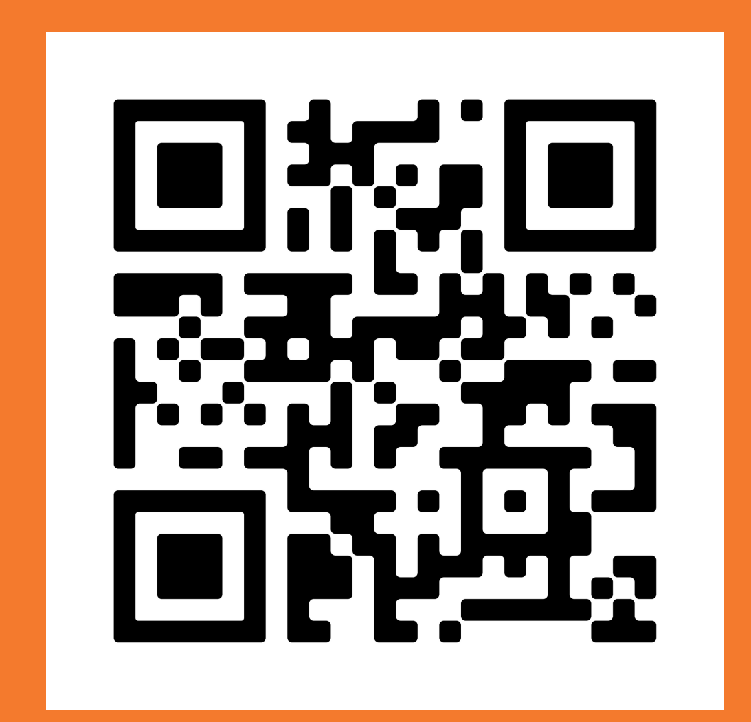
RCC Counseling and Advising